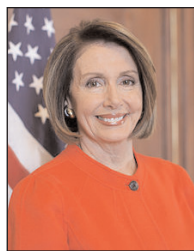
Rep. Nancy Pelosi