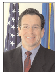
Gov. Dan Malloy

The Connecticut state House sent a medical cannabis bill last month to the state Senate by a vote of 96-51.